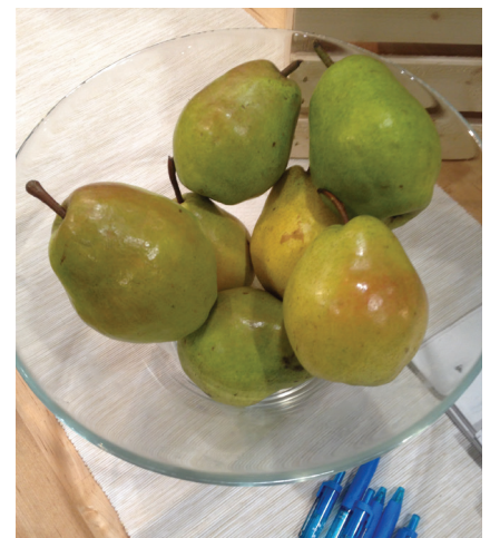
The Cold Snap™ pear.