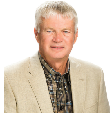
The Honourable Lyle Vanclief

Mr. Vanclief was first elected as a Member of Parliament in 1988 and re-elected in 1993, 1997 and 2000. He served as opposition critic for agriculture, then as Chair of the House of Commons Standing Committee on Agriculture and Agri-Food before joining the Cabinet for six-and-a-half years as federal Minister of Agriculture and Rural Affairs from 1997 until 2003. He retired from politics in 2004.