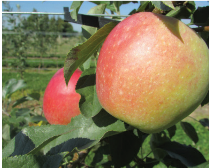
New apple varieties at Vineland's farm.

The apple varieties show a strong level of diversity in characteristics, such as astringency, fruit size and flavour.