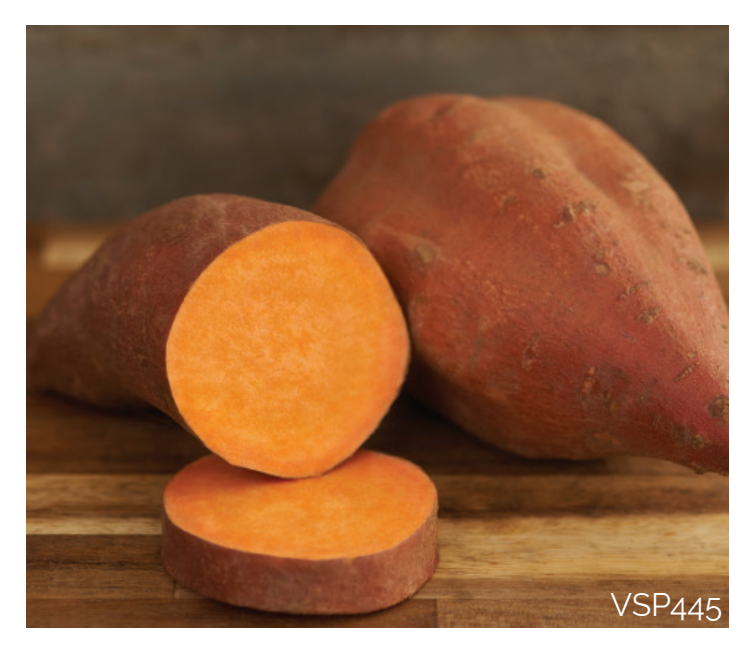
Locally-adapted and set for 2019 release.

(Excerpts of this story can be found in Vineland's 2017-2018 Innovation Report).