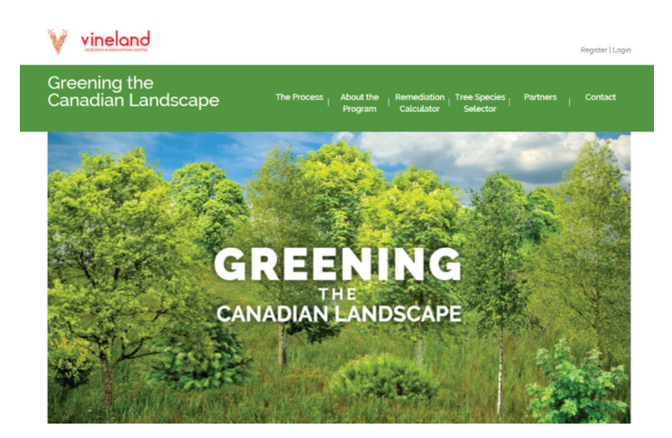
<u>Greeningcanadianlandscape.ca</u> helps improve tree survival in challenging urban environments.

Vineland Research and Innovation Centre has developed a new website based on its research findings to improve tree longevity in challenging locations. Greeningcanadianlandscape.ca offers a soil remediation calculator and tree species selector to ensure successful tree plantings, even on difficult sites. By considering key factors influencing tree survival including soil quality and health and selecting proper tree species, healthier trees can be grown for more resilient and greener landscapes.