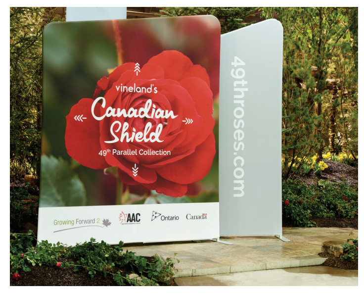
Vineland's 49th Parallel Collection.

The rose is a repeat bloomer, making it a majestic beauty all season, and just as its name suggests, it's a hardy flower that can stand up to winter and resist disease from St. John's, N.L. to Victoria, B.C.