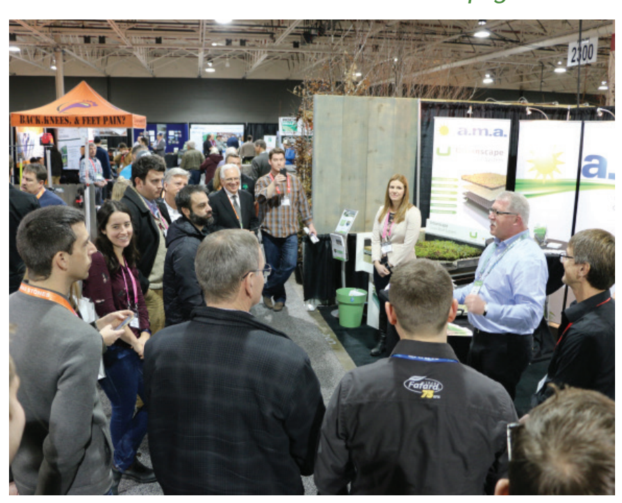
Official launch of RootSmart<sup>™</sup> at Landscape Ontario Congress (January 9, 2018).