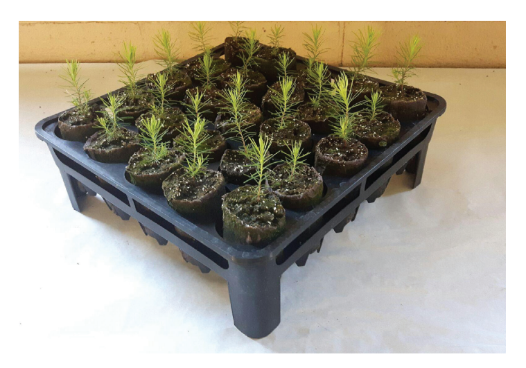
The innovative RootSmart ^{\text{TM}} propagation tray .

From reduced tree mortality rate and increased transplant success to improved crop uniformity, shorter crop cycles and reduced labour costs, growers can produce healthier, more beautiful trees.