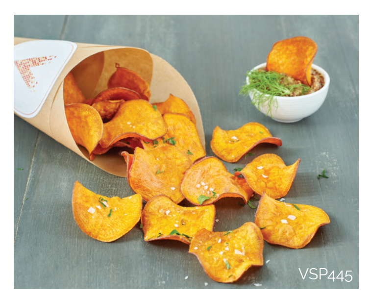
Vineland's new sweet potato variety features vibrant orange flesh.

Canadians consume on average 1.5 kilograms of sweet potatoes every year and about 4.000 acres are needed to meet this demand.