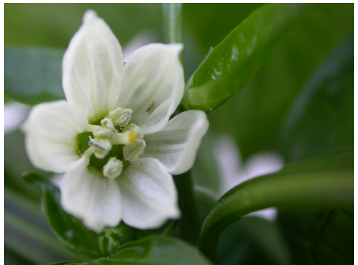
The Right Tools: Integrating Biocontrol Systems for Impact and Results.