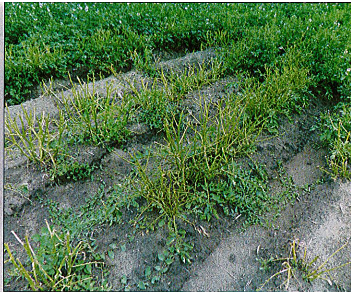
This is what can happen when a few rows of potatoes don't get an insecticide at planting. The bugs had a field day.

A third rose in the 49th Parallel series, the bright pink Aurora Borealis, will be available on the market in 2021.